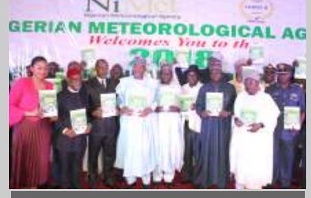
NiMet's 2018 SRP presentation -Pg 1