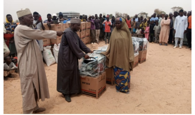
Farmers receiving irrigation equipment from BATN Foundation implementing partner, Green Sahel And Rural Development Initiative

I was able to farm in the dry season. Now I have sold my paddy and settled all my debts.