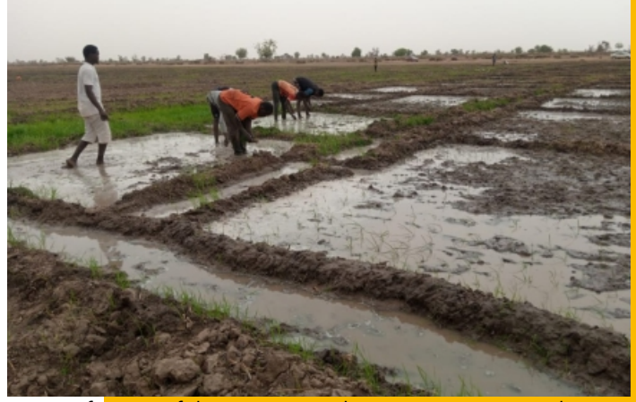
Beneficiaries of the BATN Foundation intervention working on their rice plantation.