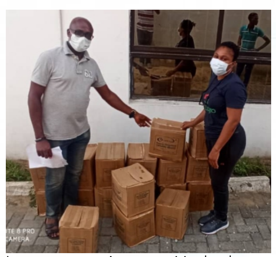
Lagos emergency Agency receiving hand sanitisers from BATN Foundation

With this donation, the Foundation hopes to support the feeding of at least 6,000 indigent households (with a bag of rice and garri each) and provide preventive support to health workers in the State's isolation centres, with the facility to wash their hands regularly.