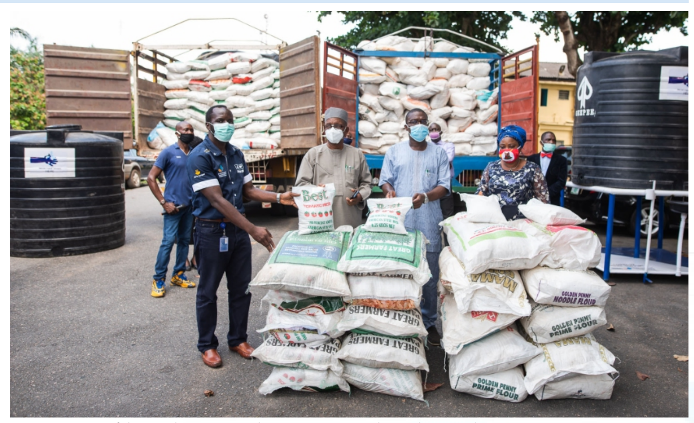
Representative of the British American Tobacco Nigeria Foundation donating the items to Oyo state Government.

has given rise to a lot of unprecedent and private interventions and British American Tobacco Nigeria Foundation also played a part in the fight against the spread of the virus with a donation of relief materials worth over $\frac{1}{2}$35 million to Lagos and Oyo state governments.