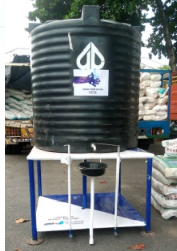
Mobile contactless hand wash station