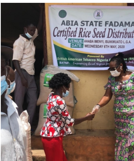
Farmers receiving rice seeds from BATN Foundation implementing partner, Abia State FADAMA