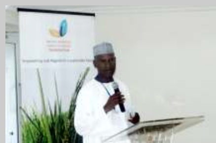
BATNF hosts 4th IP Workshop -Pg 3