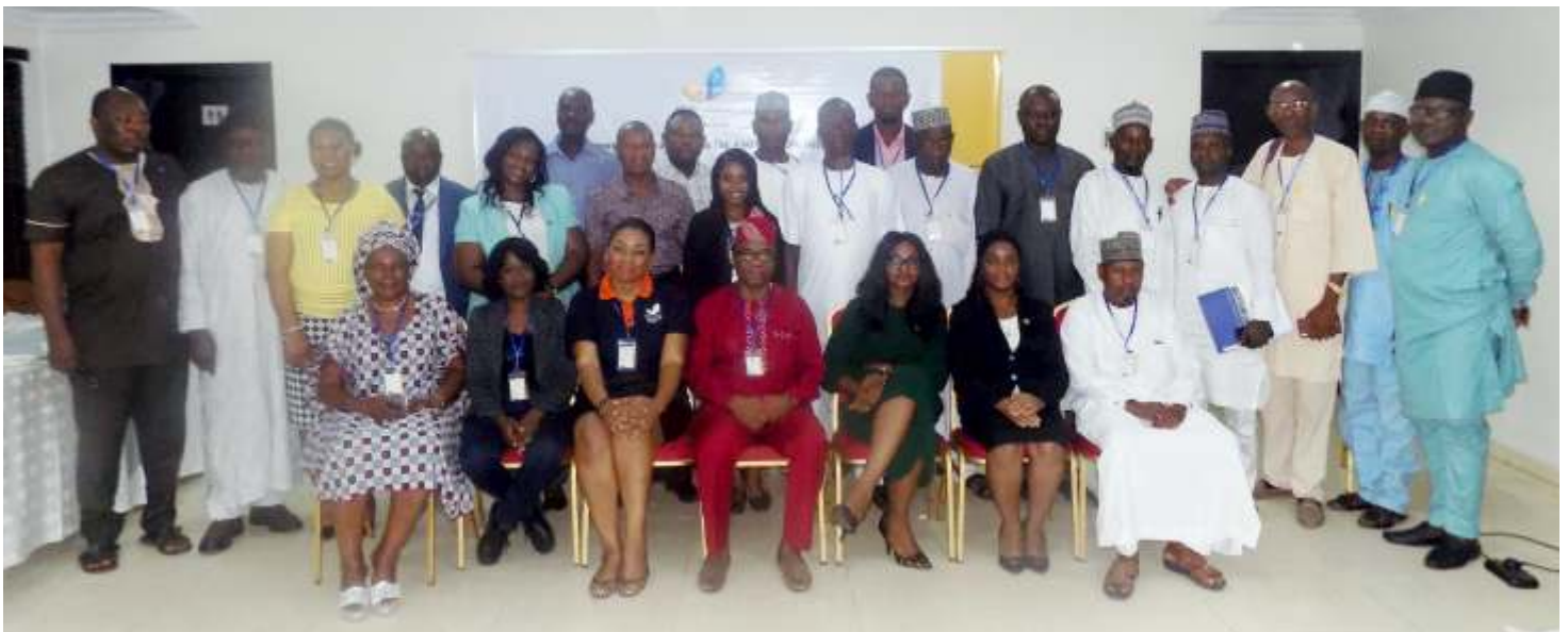
Group photograph of participants at the Workshop.

The workshop had in attendance 22 implementing partners made up of government institutions, development agencies and the private sector.