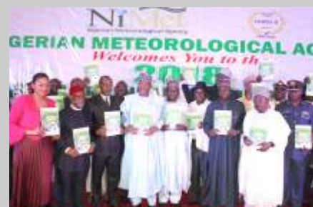
NiMet's 2018 SRP presentation -Pg 1